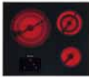
KM5820 60 cm (24")