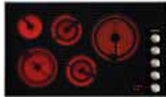
KM5627 90 cm (36")