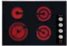
KM5624 76 cm (30")