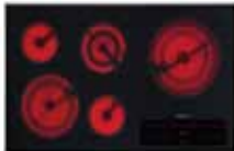
KM5860 90 cm (36")