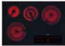
KM5840 76 cm (30")