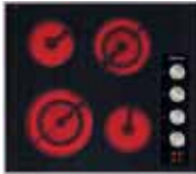
KM5621 60 cm (24")