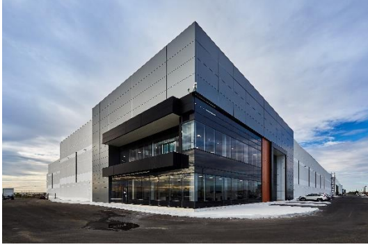
Photo 1: Exterior view of the Vaughan Distribution Centre, highlighting the modern façade and glass-fronted office area.