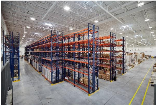
Photo 2: Interior view of the Distribution Centre, showcasing the high racking system and organized storage layout.