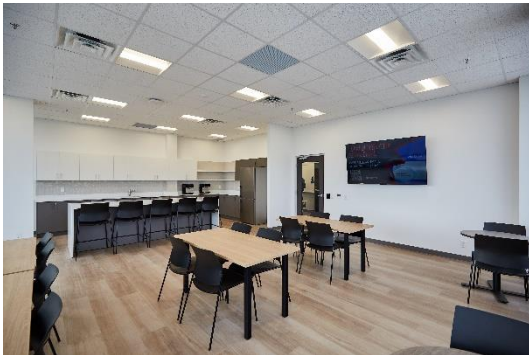
Photo 5: Staff kitchen area, offering a bright and comfortable space for employees.