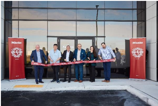
Photo 6: Miele and Kenco executives officially inaugurated the new Distribution Centre with a ceremonial ribbon-cutting.